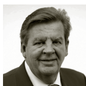
J P Rupert (59) CHAIRMAN

Directorships: Executive Chairman of Compagnie Financière Richemont SA and Reinet Investments Manager SA and Non-executive Chairman of VenFin Limited and Chairman of Business Partners Limited.